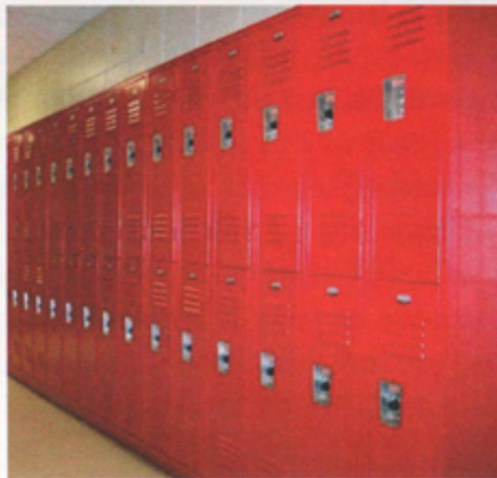
We Can Make Them Look Brand New!

We use the latest and most advanced locker refinishing methods.