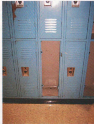
Do Your Lockers Look Like This?

Smaller Budget? Refurbish your existing lockers instead of replacing them for a fraction of the cost.